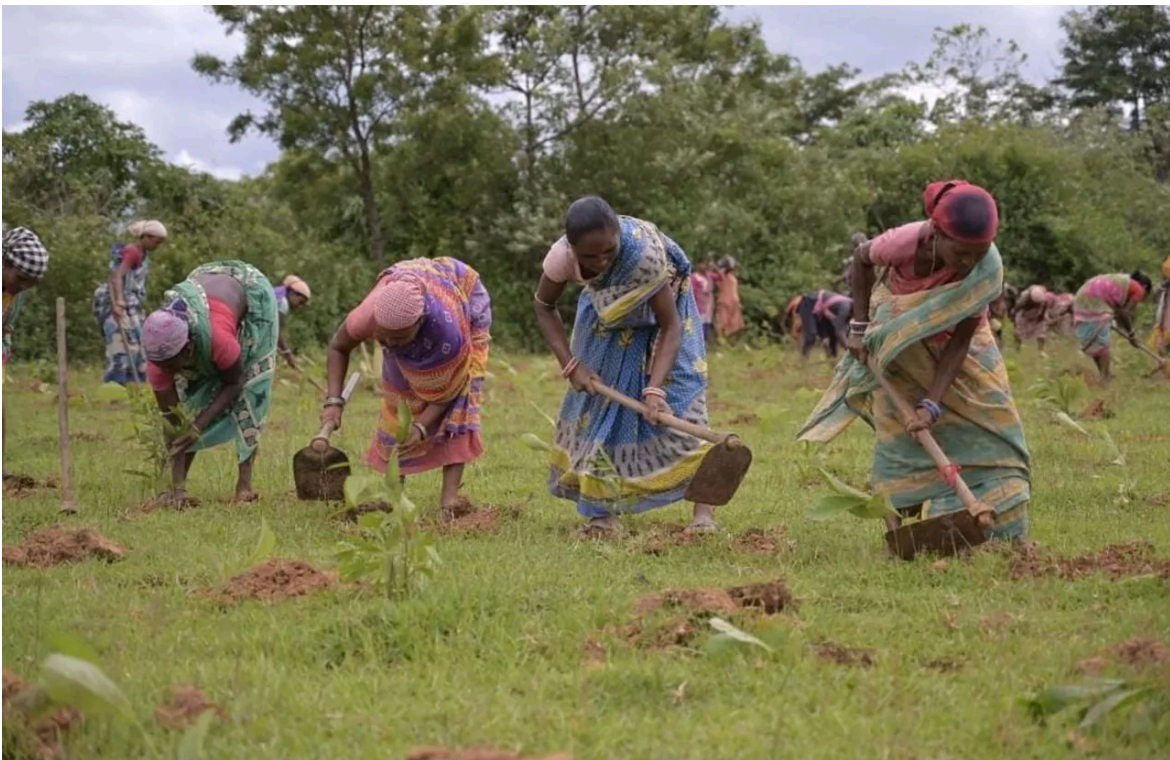
Women participating in tree plantation activities

In the global discourse on climate change, a crucial yet often overlooked perspective is that of women. While climate change affects everyone, women, girls, and marginalised communities are disproportionately vulnerable to its devastating impacts.