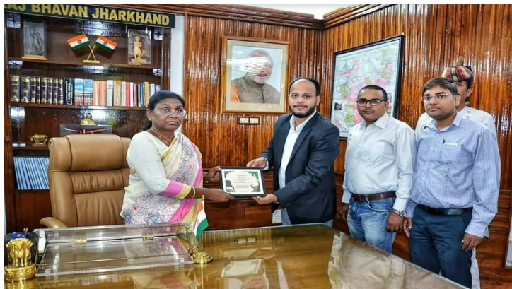
Honorable President, Draupadi Murmu, at the Raj Bhavan during her tenure as the Governor of Jharkhand.